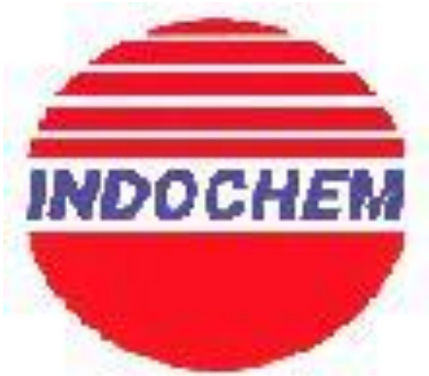
INDOCHEM OIL INDIA LTD.